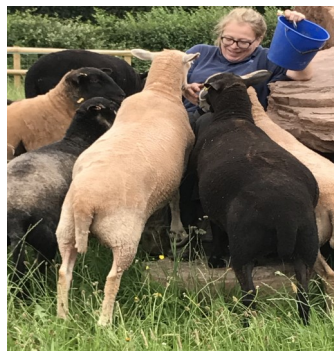
Animals are the best therapy!

All activities will be supported by our staff and tailored to each visitor's abilities and choices.