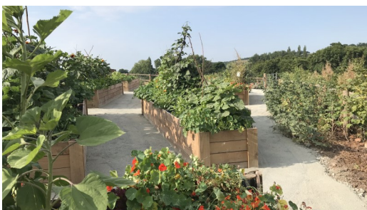
Wheelchair friendly raised beds in the vegetable garden

Avenbury Care Farm C.I.C. is a special day centre for people with learning disabilities, physical disabilities, dementia and additional needs.